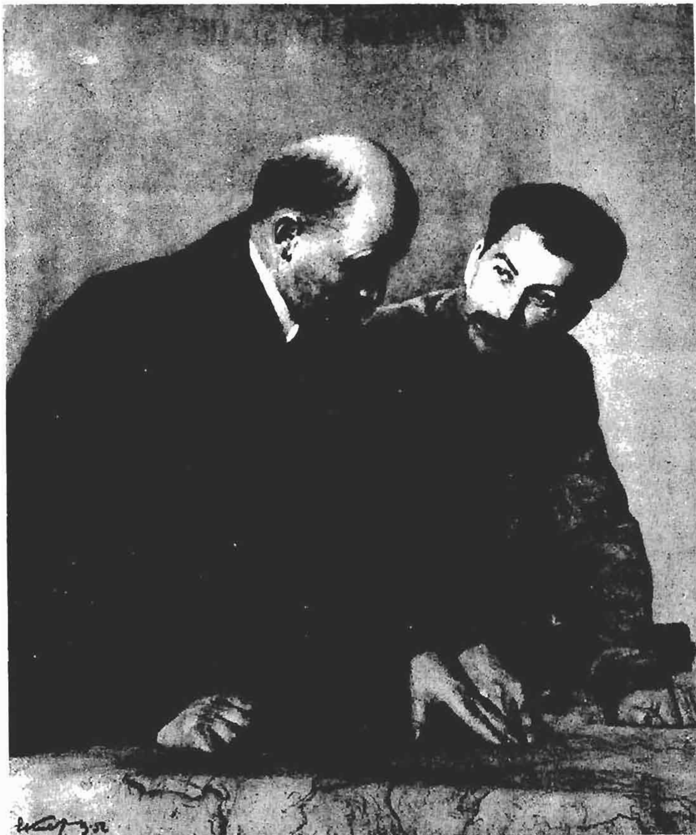
VLADIMIR ILYICH LENIN AND JOSEPH STALIN, LEADERS OF THE COMMUNIST PARTY OF THE SOVIET UNION (BOLSHEVIK) AND ARCHITECTS OF THE MARXIST-LENINIST THESES ON THE NATIONAL QUESTION IN THE AGE OF IMPERIALISM