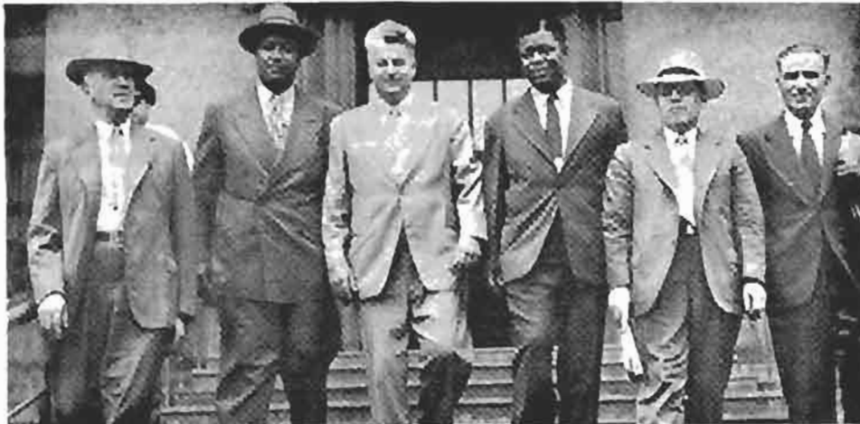
LEADERS OF THE COMMUNIST PARTY USA BETRAYED THE REVOLUTIONARY PRINCIPLES OF MARXISM-LENINISM AND RENOUNCED THE PARTY'S STAND ON THE RIGHT OF THE AFRO-AMERICAN NATION TO POLITICAL SECESSION. PARTY LEADERSHIP, 1948.

In regard to Garveyism, Haywood had said in 1933, "Under phrases of Negro liberation, freedom of Africa, the inevitable trend of these movements is to an active alliance with the most reactionary imperialist groups against the national liberation movement of the Negro