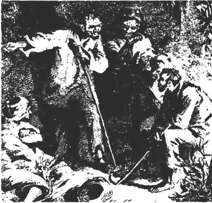
SLAVE INSURRECTIONS WERE THE BEGINNING OF THE LONG STRUGGLE OF THE AFRO-AMERICAN PEOPLE FOR LIBERATION.

above-mentioned lines was accelerated. The War of Independence was the first phase in the U.S. bourgeois democratic revolution. Americans were no longer subject to the British king, a republic was formed and a wider form of suffrage, although not universal, was established.