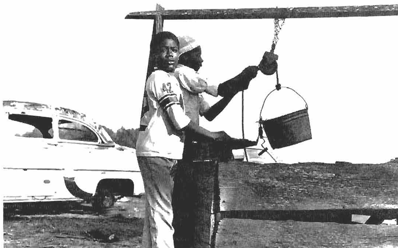
YOUTH IN THE BLACK BELT HOMELAND OF THE AFRO-AMERICAN PEOPLE, 1982

The common economic life of the nation evolved during the battle for Reconstruction. The territorial and economic issues discussed earlier were intertwined with the massive developments taking place during that period. In the political realm, there were numerous conventions of freedmen that passed various manifestos calling for freedom and democracy, economic and political power. The legislatures with large numbers of Afro-Americans and poor farmers enacted revolutionary