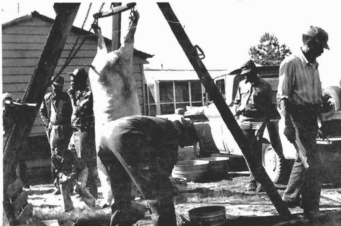
MILLIONS OF AFRO-AMERICANS STILL LIVE IN THE BLACK BELT WHERE THEY HAVE DEVELOPED A COMMON ECONOMIC LIFE AND CULTURE

Despite their elaborately-concocted statistical and pseudo-theoretical arguments, their fundamental position is that racism is the basis of the oppression of Afro-Americans. Passing over much of their revisionist exposition, we come to the point of their new Lovestoneite theory, that there exists a "white united front" based on the "white racial group."