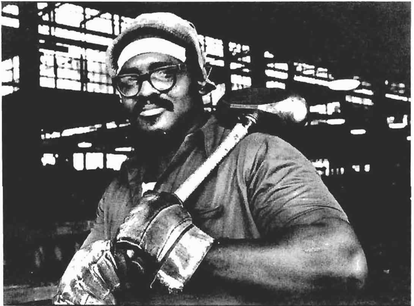
THE AFRO-AMERICAN PROLETARIAT, WHICH HAS KNOWN ONLY SUFFERING AND ABUSE AT THE HANDS OF THE ANGLO-AMERICAN BOURGEOISIE, IS THE MOST REVOLUTIONARY SECTION OF THE NATIONAL MOVEMENT

[The National Conference of Studies on the Anti-Fascist National Liberation War of the Albanian People, Tirana, 1975, p. 27]