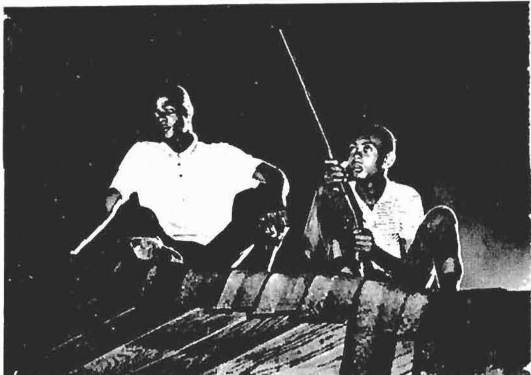
AFRO-AMERICAN YOUTHS STAND GUARD, DEFENDING THE PEOPLE'S MOVEMENT AGAINST REACTIONARY VIOLENCE - MISSISSIPPI, AFRO-AMERICAN NATION, 1964

Thesis & Resolutions for the Seventh National Convention of the Communist Party, USA , by Central Committee Plenum, March 31-April 4, 1930.