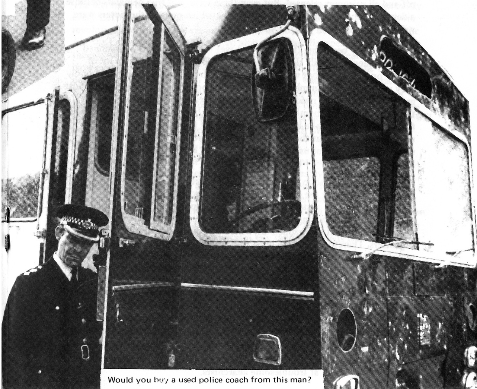
Would you buy a used police coach from this man?