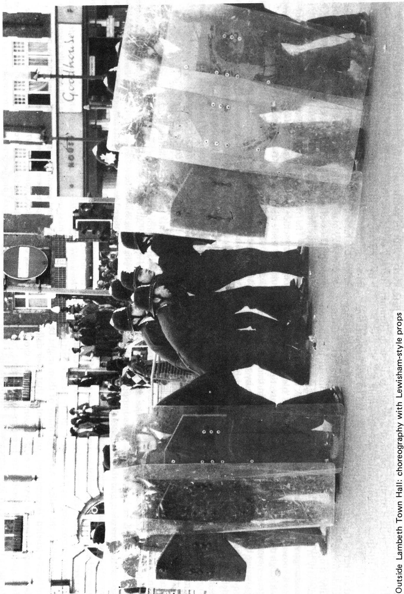
Outside Lambeth Town Hall: choreography with Lewisham-style props