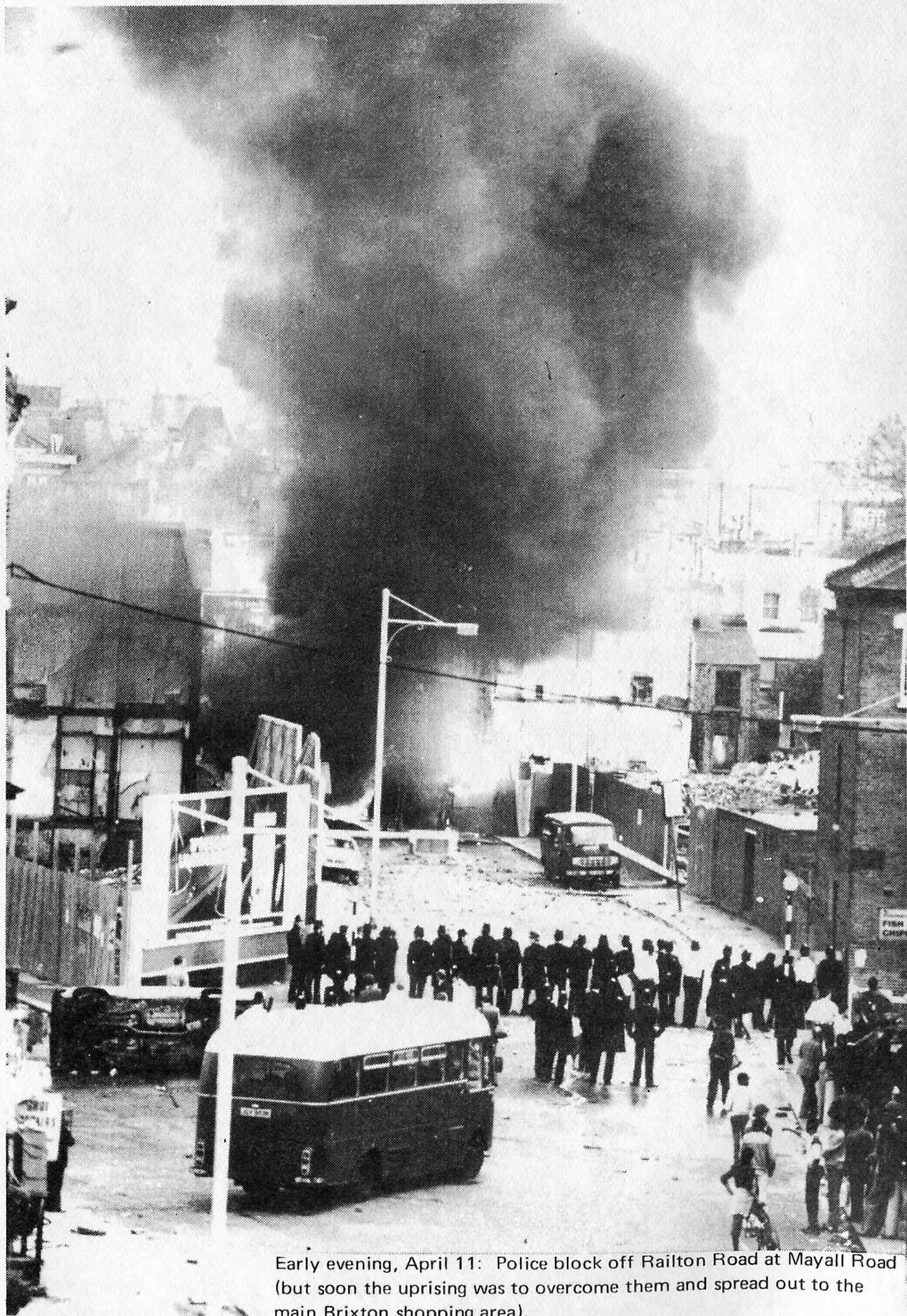
Early evening, April 11: Police block off Railton Road at Mayall Road (but soon the uprising was to overcome them and spread out to the main Brixton shopping area).