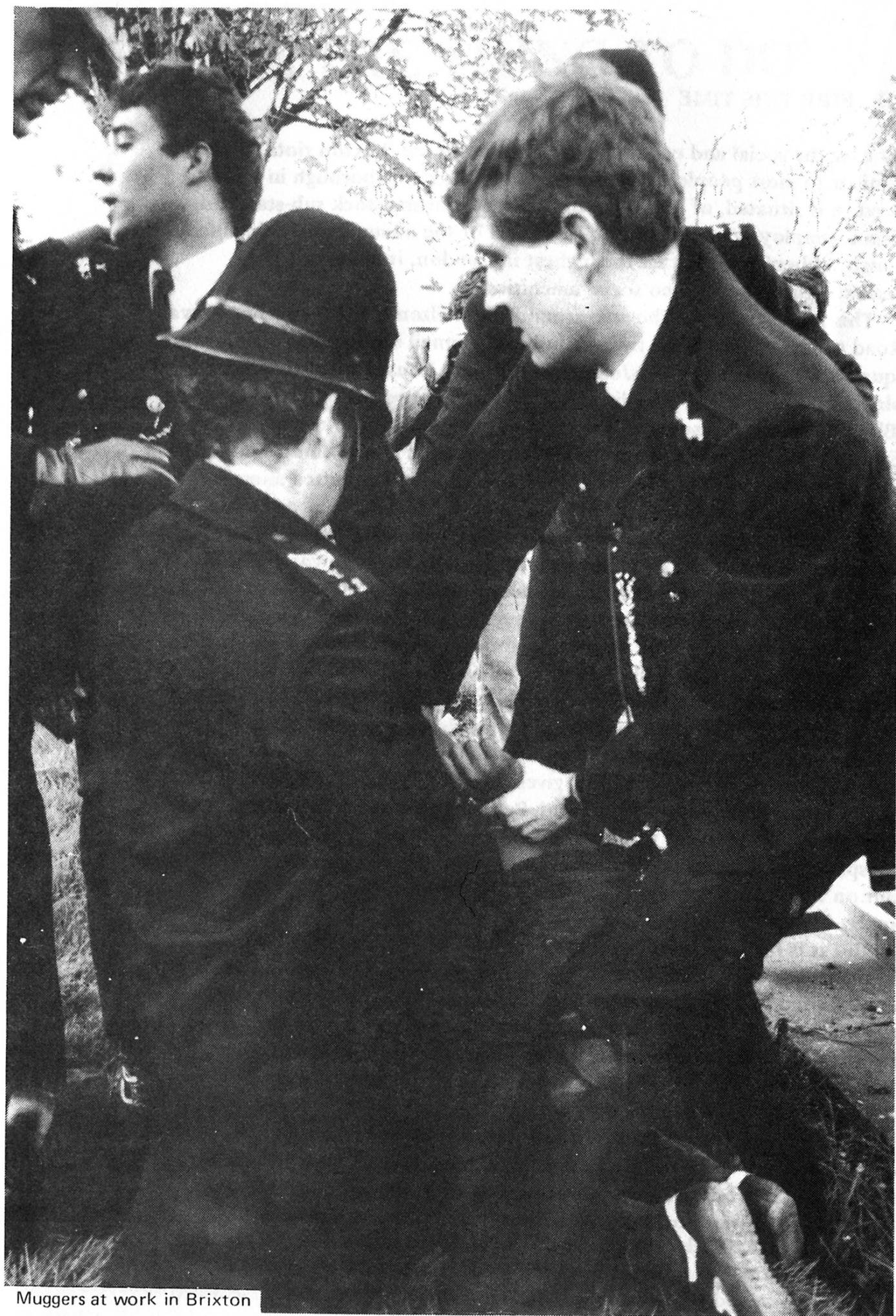
Muggers at work in Brixton