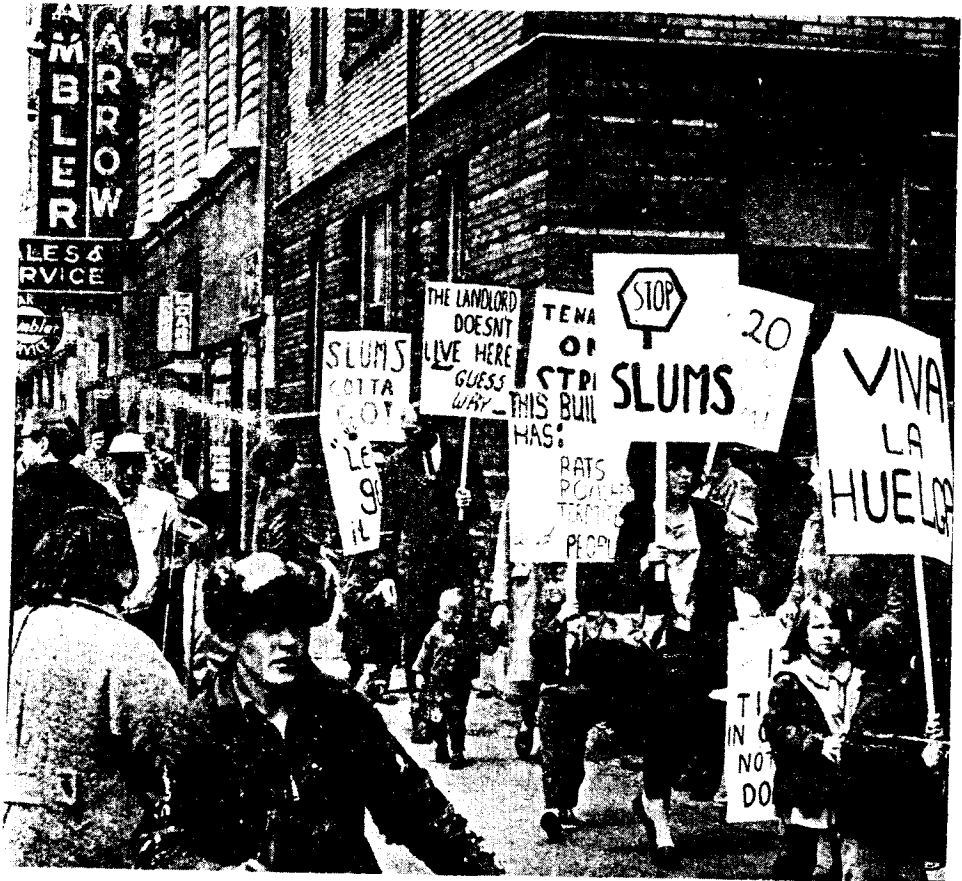
RENT STRIKE IN UPTOWN, 1966

impulses. The democratic, "participatory" tone of all ERAP projects has, in this respect, contributed to the emergence of a new popular movement (SNCC veterans returning to campus were, in the same fashion, much more important). But with respect to the labor movement and liberal membership organizations, no such success could be claimed. Before too long, the attitude of most ERAP organizers toward the organizations of labor and the liberal middle class changed from one of hope to one of the deepest hostility and contempt. 2