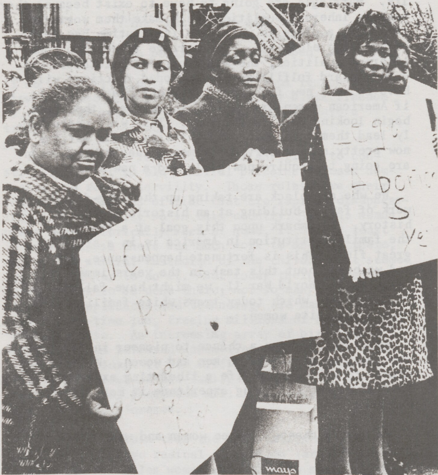
Women demonstrating in New York march demanding repeal of state abortion laws, March 28.